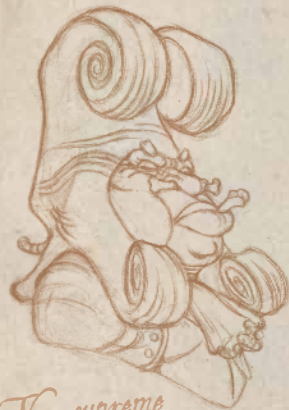
The supreme Duke Skazzu Milingo