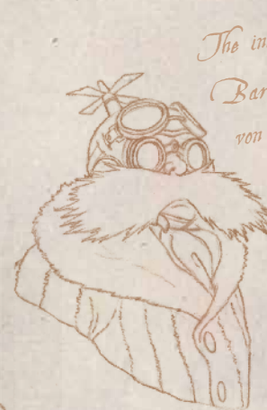
The indefatigable Baron Netto von Perux